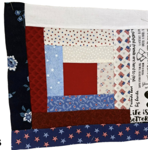
Example of a Log Cabin Block made by the guild

This year, in honor of America250 , the Milltown Quilters have focused their efforts on creating quilts honoring veterans through Quilts of Valor . The guild have spent several months cutting, stitching, and quilting Log Cabin Blocks in support of this effort. These quilts will be donated to local veterans throughout the state.