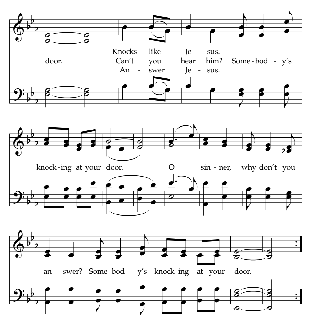
DISCIPLESHIP AND MISSION