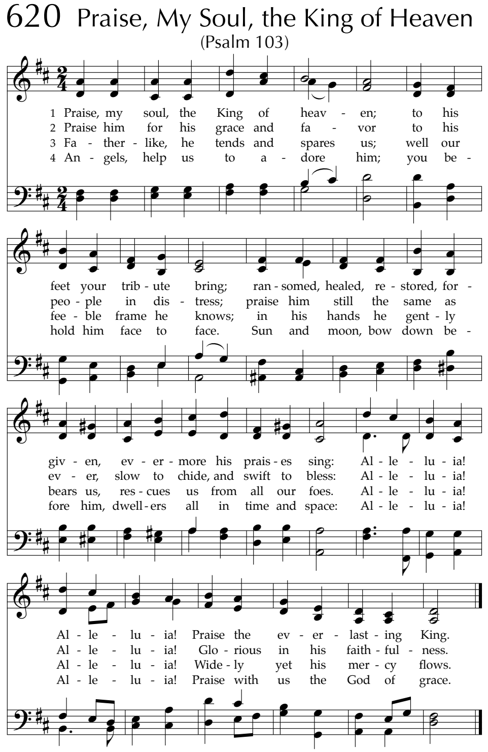
This free paraphrase of Psalm 103 gains much energy and conviction by including the double "Alleluia!" before the final line of text. That repeated four-note figure descending from the tune's highest note gives voice to the praise that the rest of the hymn evokes.