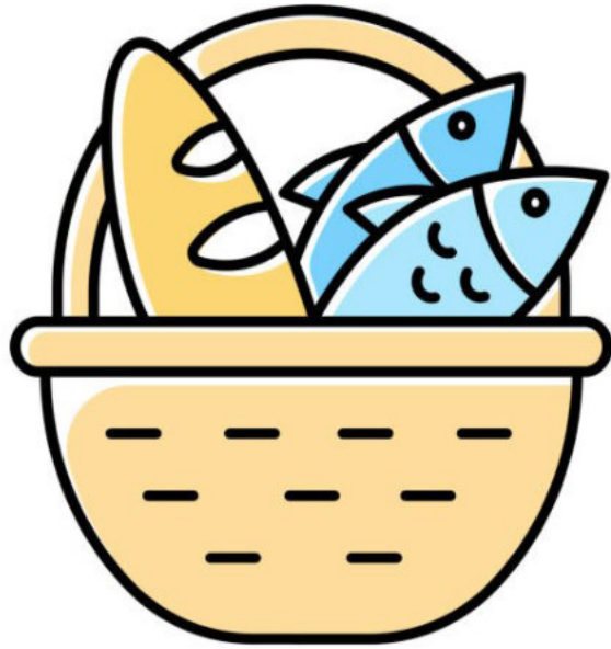
Table for Five...Thousand! The Miracle of the Loaves and Fishes