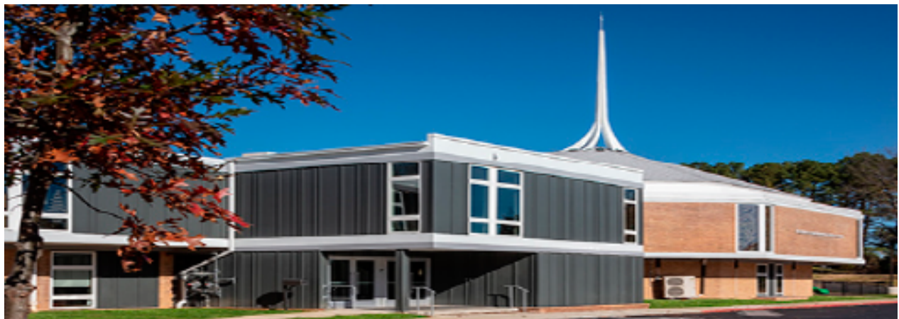
Christ Memorial Presbyterian Church 10600 Shaker Dr., Columbia, MD 21046